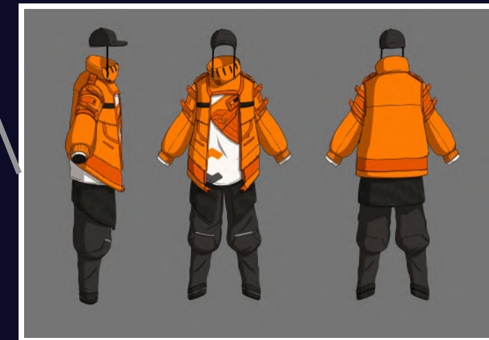
Packed with utilities