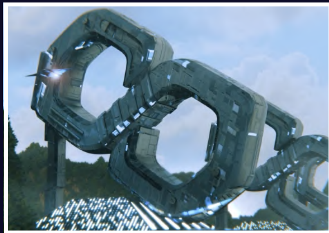
Well known Brand