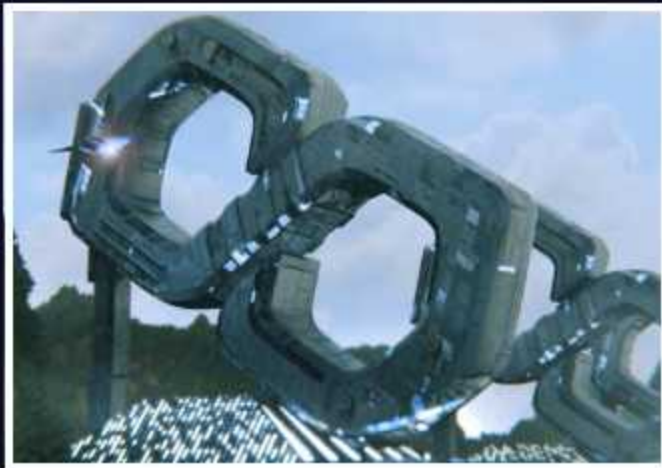
Well known Brand