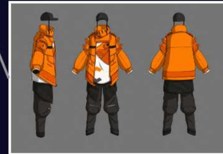
Packed with utilities